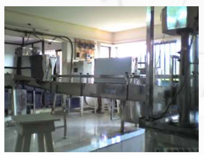
Bottling Line Set-up by I-Maconi for FANI NIGERIA LIMITED