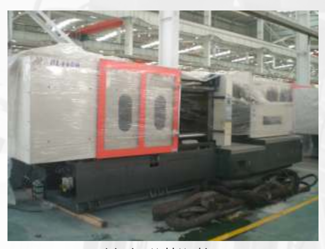
Injection Mold Machine